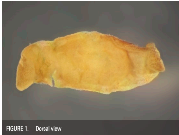
FIGURE 1. Dorsal view